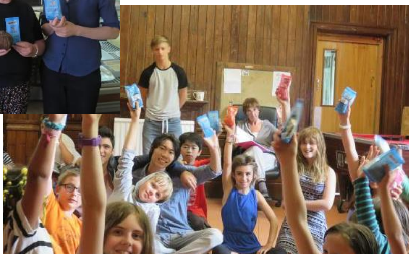
(Picture, Summerhill kids voting to support Liberation's nut products)